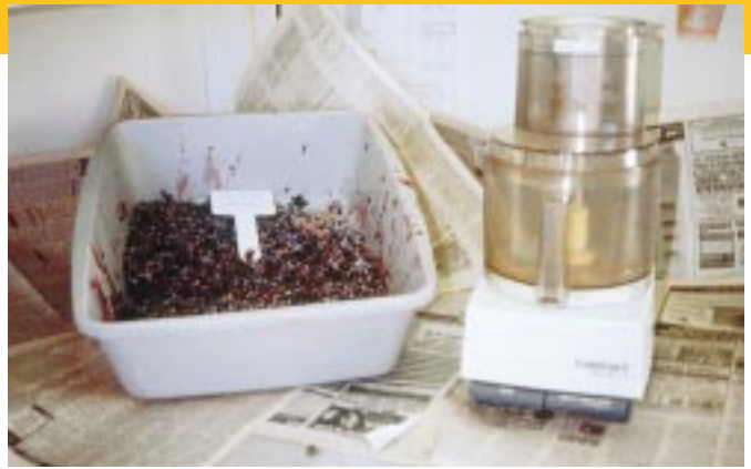
Figure 1. Elderberry fruits ready for cleaning and my trusty food processor.

USDA NRCS. 2002. The PLANTS database, version 3.5. URL: http://plants.usda.gov (accessed 14 Aug 2003). Baton Rouge (LA): The National Plant Data Center.