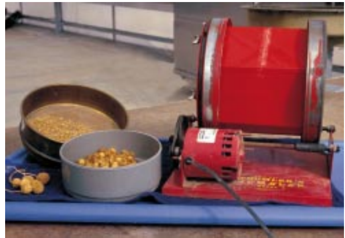
Figure 2. At Los Lunas Plant Materials Center, dry fruiting heads of Arizona sycamore, seen lower left, are crushed under water in a large pan. The hairs agglomerate into balls (gray sieve in foreground). A slurry of achenes and pea gravel are tumbled in the rock tumbler to dislodge the hairs. Finally, the achenes, hairs, and pea gravel are separated with soil sieves with the cleaned achenes visible in the brass sieve (background).