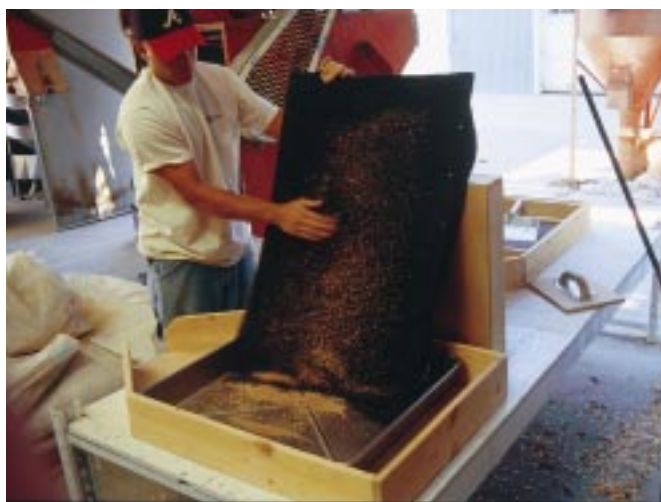
Figure 2. When tossed at a piece of felt, desired Asteraceae seeds fall into a collection pan but unwanted grass seeds, with their prickly appendages, are caught on the felt.