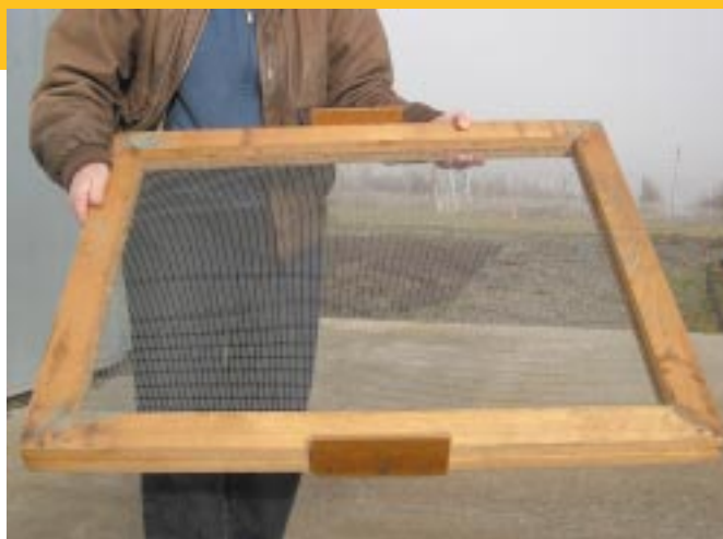
Figure 2. A wooden frame covered with hardware cloth makes an effective grass seed cleaning device.

paper bags, too. After collecting seed heads, we sit on the ground with the screen and rub the plant material vigorously a few times to dislodge the seeds from the inflorescences, which fall onto the drop cloth. We pour seeds into paper bags for transport back to the nursery.