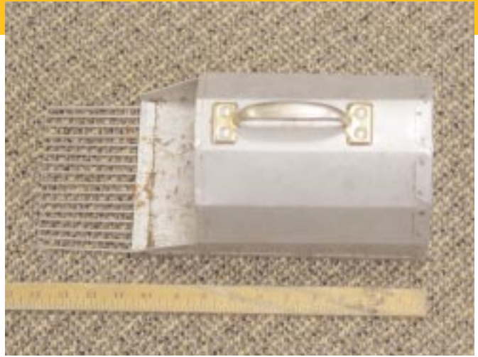
Figure 2. A custom-made metal harvester for collecting fruits.