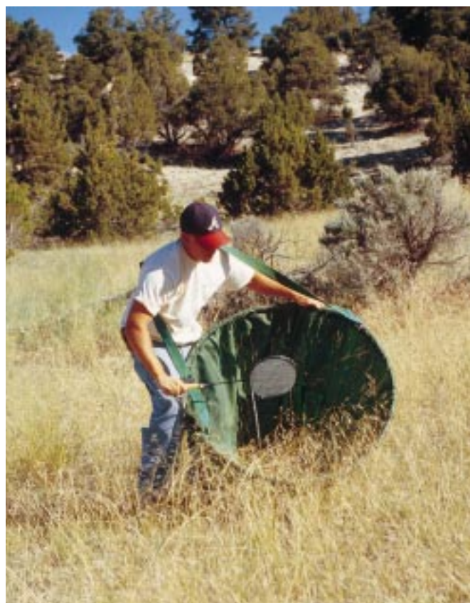
Figure 1. Collecting Asteraceae seeds with badminton racquet and a hopper made from cordura cloth sown onto a round frame.

Of course, some disparity in ripening time occurs among plants in a population. Because you may not be able to return to the site repeatedly to maximize a collection, we have experimented with collecting heads prior to full ripening. On the same day at the same site, long-leaf hawksbeard collected early (seed heads not open) had 40% viability while those collected with open heads yielded 61% viability. The effect of storage on viability of these 2 lots is unknown, but it is apparent that