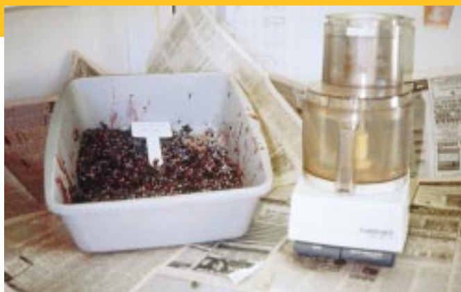
Figure 1. Elderberry fruits ready for cleaning and my trusty food processor.

USDA NRCS. 2002. The PLANTS database, version 3.5. URL: http://plants.usda.gov (accessed 14 Aug 2003). Baton Rouge (LA): The National Plant Data Center.