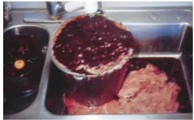
Figure 2. Floating the debris away from clean seeds.