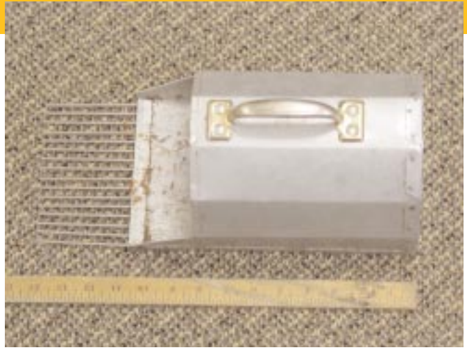
Figure 2. A custom-made metal harvester for collecting fruits.