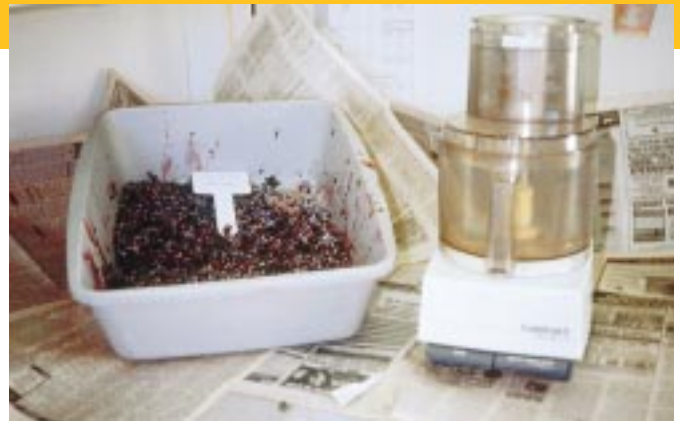
Figure 1. Elderberry fruits ready for cleaning and my trusty food processor.

USDA NRCS. 2002. The PLANTS database, version 3.5. URL: http://plants.usda.gov (accessed 14 Aug 2003). Baton Rouge (LA): The National Plant Data Center.