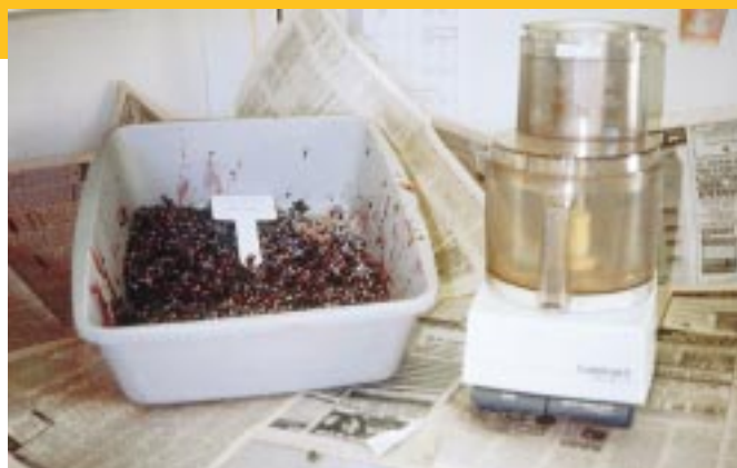
Figure 1. Elderberry fruits ready for cleaning and my trusty food processor.

USDA NRCS. 2002. The PLANTS database, version 3.5. URL: http://plants.usda.gov (accessed 14 Aug 2003). Baton Rouge (LA): The National Plant Data Center.