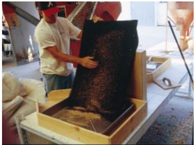
Figure 2. When tossed at a piece of felt, desired Asteraceae seeds fall into a collection pan but unwanted grass seeds, with their prickly appendages, are caught on the felt.