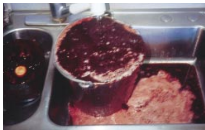
Figure 2. Floating the debris away from clean seeds.