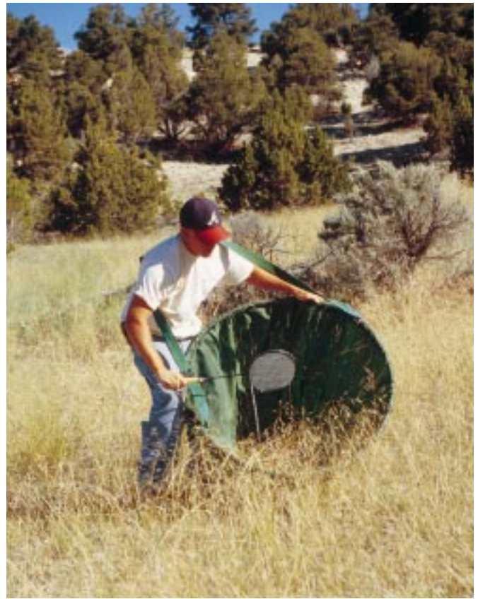
Figure 1. Collecting Asteraceae seeds with badminton racquet and a hopper made from cordura cloth sown onto a round frame.

Of course, some disparity in ripening time occurs among plants in a population. Because you may not be able to return to the site repeatedly to maximize a collection, we have experimented with collecting heads prior to full ripening. On the same day at the same site, long-leaf hawksbeard collected early (seed heads not open) had 40% viability while those collected with open heads yielded 61% viability. The effect of storage on viability of these 2 lots is unknown, but it is apparent that