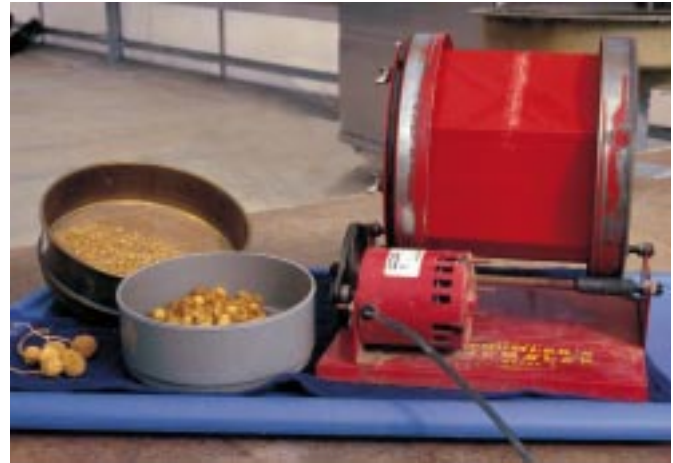
Figure 2. At Los Lunas Plant Materials Center, dry fruiting heads of Arizona sycamore, seen lower left, are crushed under water in a large pan. The hairs agglomerate into balls (gray sieve in foreground). A slurry of achenes and pea gravel are tumbled in the rock tumbler to dislodge the hairs. Finally, the achenes, hairs, and pea gravel are separated with soil sieves with the cleaned achenes visible in the brass sieve (background).