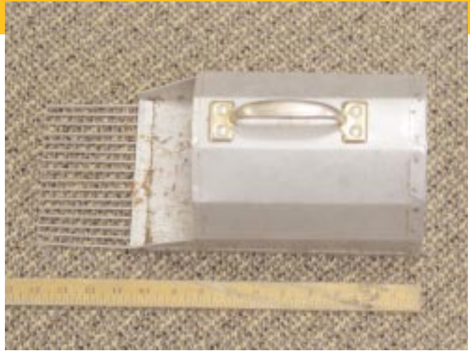
Figure 2. A custom-made metal harvester for collecting fruits.