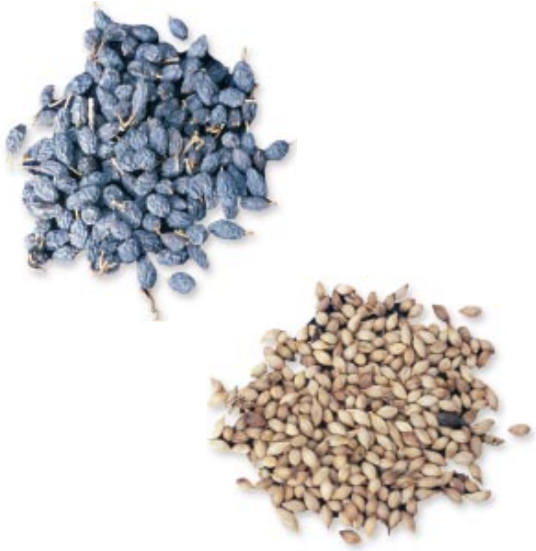
Figure 1. The pulp of naturally dehydrated fruits (top) of New Mexico olive can be removed using a rock tumbler, leaving extremely clean seeds (bottom).

For a few species, wet tumbling may partially substitute for a cold stratification requirement. Two currant species ( Ribes aureum Pursh and R. cereum Dougl. [Grossulariaceae]) and wolfberry ( Lycium torreyii Gray [Solanaceae]) generally require 2 to 3 mo of cold stratification to achieve acceptable germination. Wet tumbling followed by 1 to 2 wk of storage in a warm moist environment has resulted in germination without cold stratification. The dry seeds of another important riparian species, redosier dogwood ( Cornus sericea L. ssp. sericea [Cornaceae]), generally require 1 h scarification in concentrated sulfuric acid and then 2 to 3 mo of cold stratification for acceptable germination. Using fresh fruit with hydrated pulp, rapid germination has been achieved by wet tumbling the fruit with 1 to 2 cm (0.5 to 0.75 in) gravel. Most of the pulp is removed in the first day of tumbling and separated by screening and float/sink manipulations in water. After pulp removal, seeds are wet tumbled for several more days with daily water changes. The imbibed seed is then stored in a warm moist environment; germination starts in about 7 to 10 d and continues for several weeks. Although a limited number of species have been tested with wet tumbling for seed conditioning, additional species may benefit from this treatment.