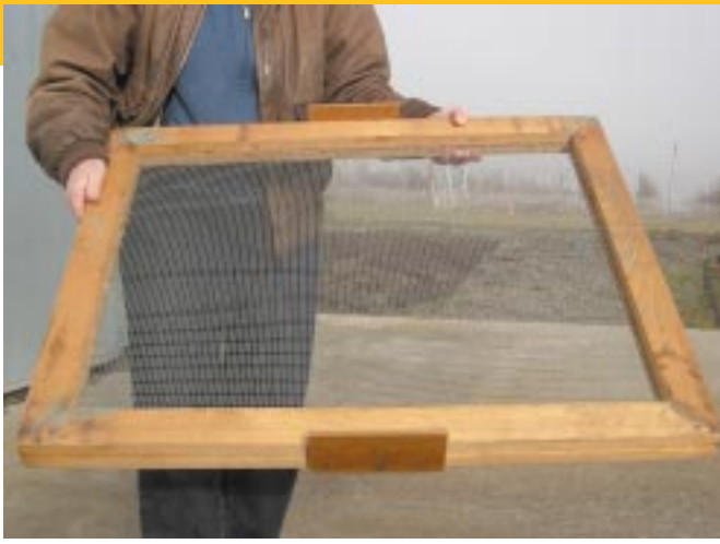
Figure 2. A wooden frame covered with hardware cloth makes an effective grass seed cleaning device.

paper bags, too. After collecting seed heads, we sit on the ground with the screen and rub the plant material vigorously a few times to dislodge the seeds from the inflorescences, which fall onto the drop cloth. We pour seeds into paper bags for transport back to the nursery.