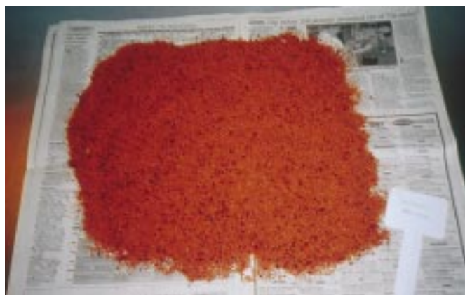
Figure 3. Clean elderberry seeds ready for storage.