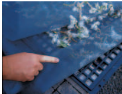
Capsules are allowed to open on top of a wooden table. From bottom to top, the layers include a layer of newspaper, a plastic spacer, a sheet of fiberglass window screen, willow capsules, and a final layer of fiberglass window screen. The pieces are held in place with large thumbtacks.