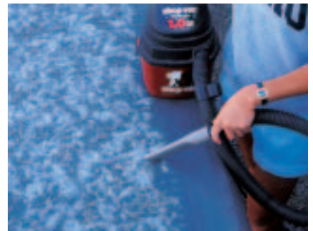
A 1-horsepower shop vacuum sucks the cotton and seeds through the window screen—coarser debris remains behind. Inside the vacuum, the cotton sticks to the cloth filter and the seeds collect in the bottom of the canister.