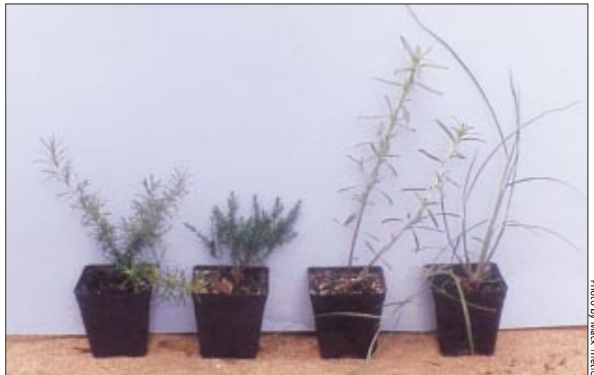
Figure 7 • False rosemary, Atlantic St Johnswort, seacoast marshelder, and gulf bluestem produced in 4-in liner pots.

(all rates), and had longer roots per cutting (no auxin and IBA 1000) (Table 5). Increasing the IBA concentration to 5000 ppm did not further improve rooting or root quality above that achieved without auxin application. As expected, shoot height differences remained between cutting sizes, and secondary branching of plants from 10 cm (4 in) cuttings was greater than secondary branching of plants from 5 cm (2 in) cuttings (Table 5). Both 5 and 10 cm (2 and 4 in) cuttings may be used for propagation. Shorter cuttings produced acceptable transplants and should be used when cutting