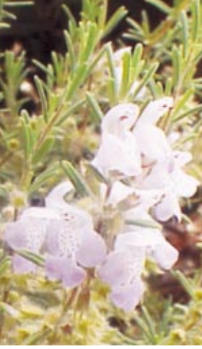
Figure 1 • False rosemary (Conradina canescens) shoot and flower detail and entire plant growing in a nonirrigated Florida landscape.