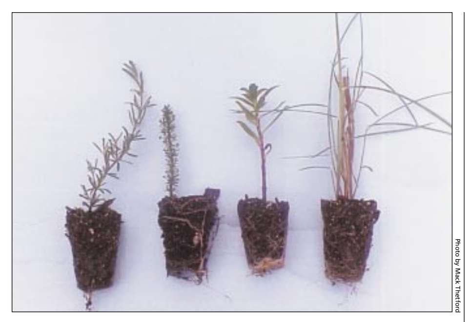
Figure 6 • Rooted cuttings of false rosemary, Atlantic St Johnswort, seacoast marshelder, and gulf bluestem 5 wk after sticking cuttings in 72-cell flats under intermittent mist.

Downloaded from by guest on April 19, 2024. Copyright 2002