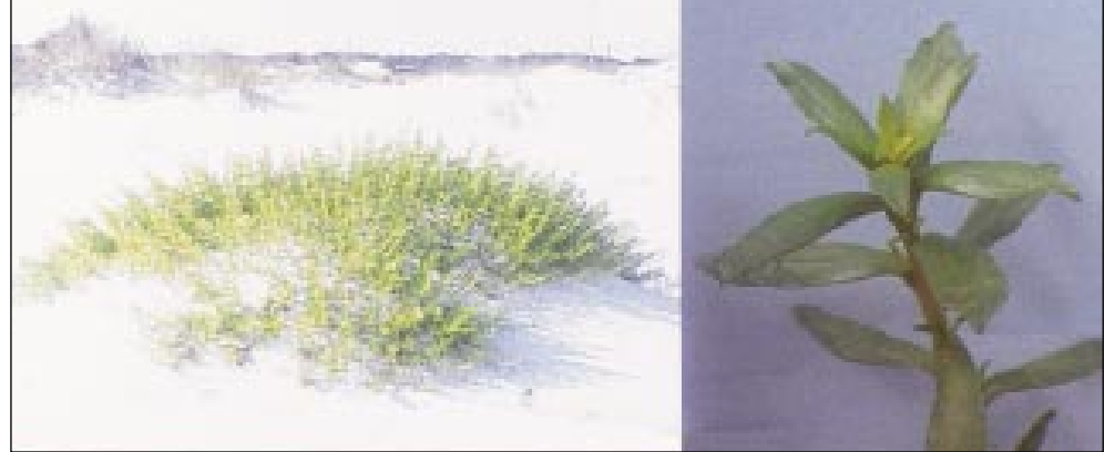
Figure 4 • Seacoast marshelder (Iva imbricata) spring foliage detail and entire plant growing in a fore-dune position.

Softwood cuttings for all 4 species were collected on 21 July 1997 from Santa Rosa Island, Florida, a coastal barrier island (Lat 30° 18'N, Long 87° 16'W), placed in plastic bags, and stored in a cooler for transport. Before treatment, cuttings were cut to a length of 10 cm (4 in) and the foliage removed from the basal 1 cm (0.4 in) of each cutting. Treatments were based on 3 auxin sources (Table 1): 1) NAA ( \alpha -naphthaleneacetic acid); 2) IBA (indole-3-butyric acid); and 3) Dip 'N Grow (Astoria-Pacific Inc, Clackamas,