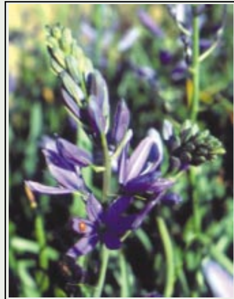
Greater Camas, Camassia leichtlinii