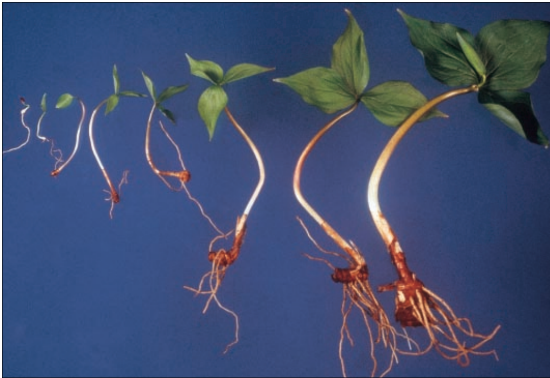
Figure 3 • Development stages of Trillium grandiflorum plants collected from the wild. Left to right: immature rhizome and cotyledon with seed coat attached after first cold period; mature cotyledon; first true (heart-shaped) leaf; whorl of 3 leaves; progressively larger leaves and rhizomes; and finally, flowering stage.

[4 X 4 X 4 in; 64 cu in]) (or deeper) pot and plant in the same medium at a depth of 0.6 to 1.2 cm (0.25 to 0.5 in) depending on the size of the rhizome. Observe the depth of the seedling rhizome before transplanting and plant accordingly. As the contractile roots grow they will pull the rhizome deeper in the pot.