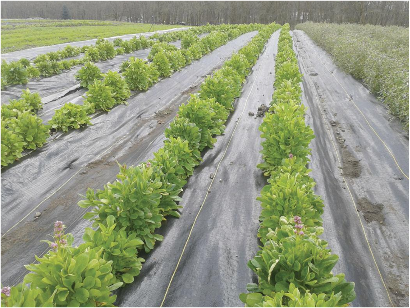
Figure 2. Shortspur seablush ( Plectritis congesta (Lindl.) DC. ssp. congesta [Valerianaceae]) planted on seed-collection fabric at the Violet Prairie native seed farm.