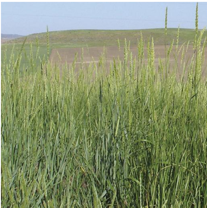
274 Basin wildrye evaluation at Blue Creek, Utah.

Basin wildrye, also referred to as Great Basin wildrye, is a perennial cool-season grass native to the western US and Canada. Basin wildrye is large-statured, caespitose, and is often