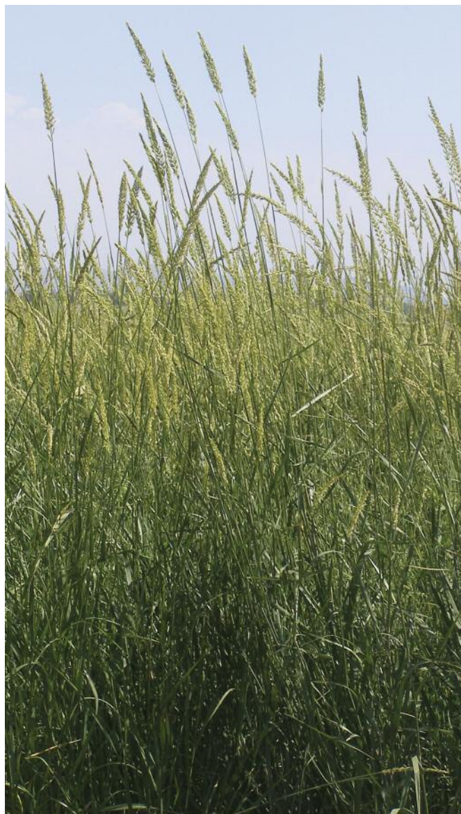
'Trailhead II' basin wildrye foundation seed production at Richmond, Utah.

The 2 cycles of stringent selection for seedling vigor within Trailhead resulted in Trailhead II basin wildrye. Trailhead II