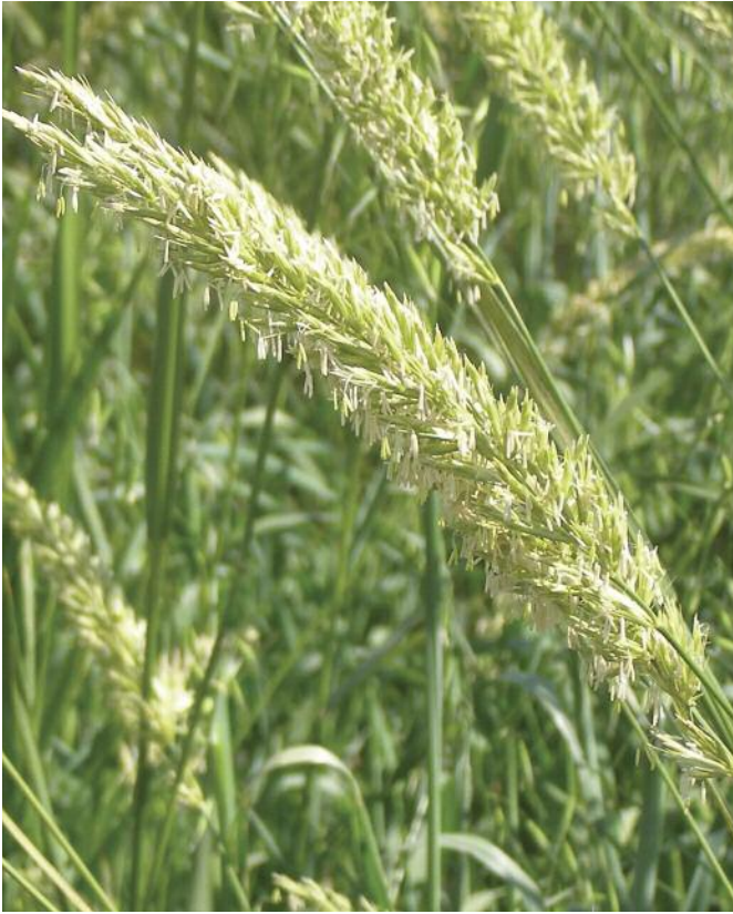
Basin wildrye seedheads and pollen.

possesses increased seedling vigor and stand establishment when compared to Trailhead. Aside from the increased seedling vigor, the selection process had minimal effect on other traits. This was evidenced by the limited morphological differences between the 2 cultivars and the miniscule increase in the genetic similarity of Trailhead II compared to Trailhead. Thus, Trailhead II serves as an apt replacement for Trailhead in re-vegetation by combining increased potential for stand establishment with only minor decrease in genetic variation.