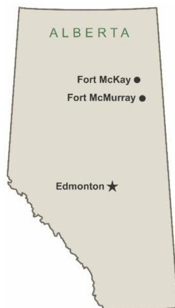
Figure 1. Map of Alberta showing the location of Fort McKay relative to Fort McMurray and Edmonton. Map by Jim Marin Graphics

Ratroot seeds were harvested from 3 naturally occurring wetlands within 200 km of Fort McKay (lat 57°11'12.3"N, long 111°38'12.3"W) in northeastern Alberta (Figure 1). The northernmost wetland was an outlet of Kears Lake, where plants grew in soil adjacent to a stream in which water levels fluctuate from season to season and year to year. The southernmost wet-