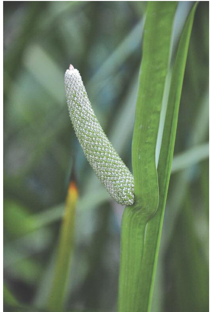
Figure 2. Immature ratroot spadix.

land was Willow Lake, with plants growing along the shoreline. Plants were floating as part of a cattail ( Typha latifolia L. [Typhaceae]) mat, connected to the shore by roots of a large willow tree. Roughly halfway between these two, Shipyard Lake lies on the Suncor mine lease. Although close to mining operations, the lake itself is relatively undisturbed as it falls in an environmental buffer maintained adjacent to the Athabasca River. Plants are found throughout the lake, floating on the surface as a constituent in cattail mats. These mats are not anchored and their configurations change frequently.