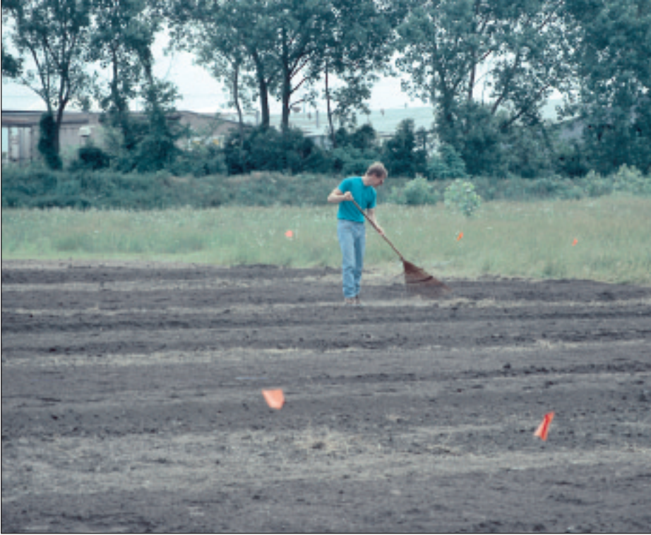
Figure 1 • Raking seeds into plots to improve seed-to-soil contact.

A Chi-square analysis was completed to determine if the actual counts differed statistically from the expected counts based on each species contribution to the seed mix. Big