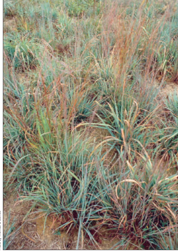
Little bluestem ( Schizachyrium scoparium (Michx.) Nash).

The City of Hammond, Indiana, has had a long association with the steel industry. Slag is discarded material after processing iron ore into steel. Past disposal practices have resulted in numerous poorly vegetated sites where slag refuse was stockpiled. Many such sites originally had uniquely diverse plant communities that included native warm season grasses, and were in areas historically used as resting sites by migratory birds (Lin and others 1996).