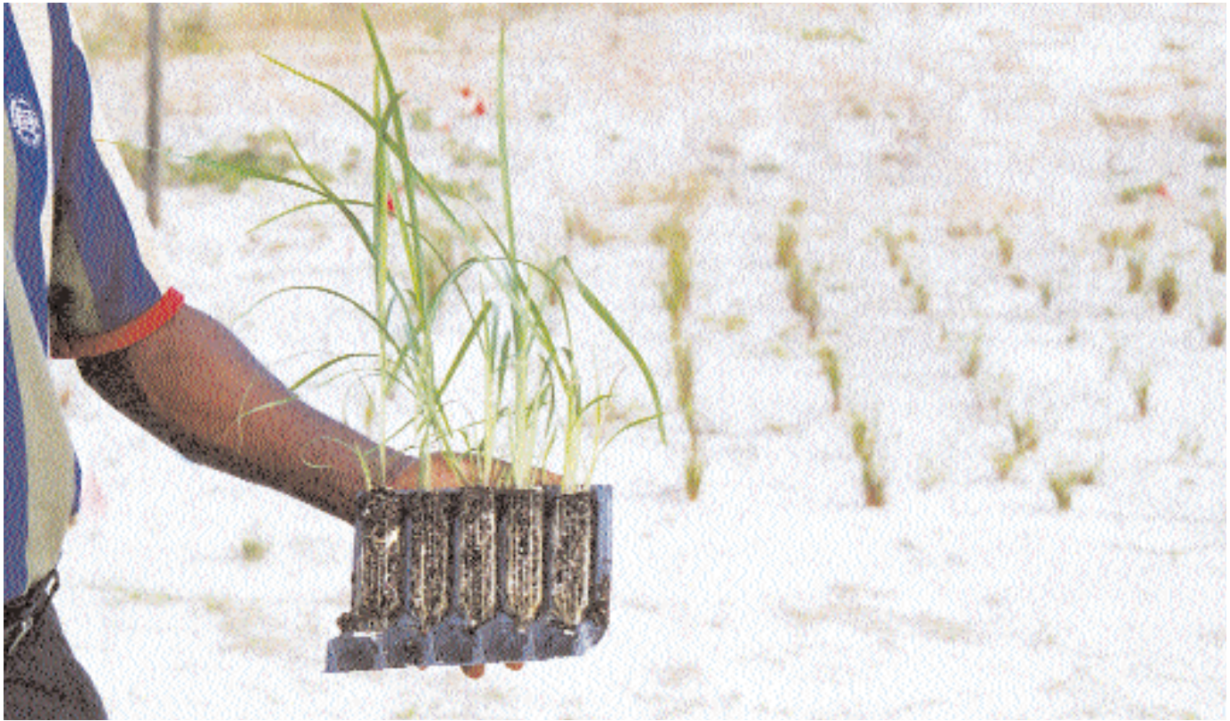
Figure 1. Tissue-cultured creeping bluestem plants prior to planting.

in creeping bluestem survival. On overburden, plantings were sprayed 5 to 6 times compared with 2 to 4 times on sand tailings (see Table 1). A large soil seed bank had been allowed to build up after overburden and sand tailings were deposited and leveled. Legumes (rough hairy indigo, shyleaf, coffeebean, and showy crotalaria ( Crotalaria spectabilis Roth [Fabaceae]) (in this order) seem to be the major broadleaf problems because of their abundance and resistance to herbicide treatments. No single herbicide was effective on all weed problems. Plateau was relatively effective on most broadleaf species and grasses (except Brachiaria sp. (Trin.) Griseb. [Poaceae]), but Weedmaster was needed for pusley ( Richardia spp. L. [Rubiaceae]) and most legumes. Only Remedy was effective on rough hairy indigo.