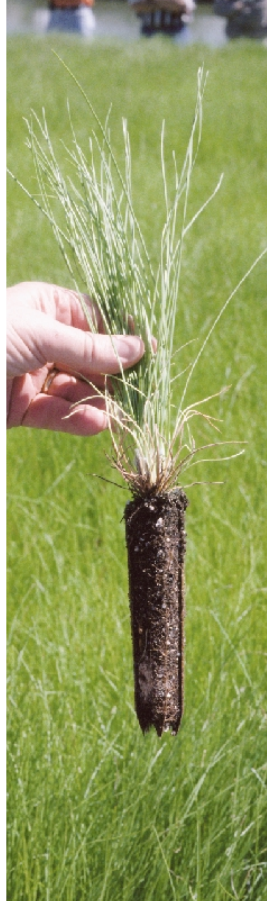
Figure 1 • A longleaf pine seedling growing in an outdoor growing area in Georgia.

Why have we failed to regenerate more longleaf pine sites? Answers to this question are related to unique botanical characteristics of the species: 1) low and infrequent seed production; 2) a seedling “grass” stage characterized by delayed stem