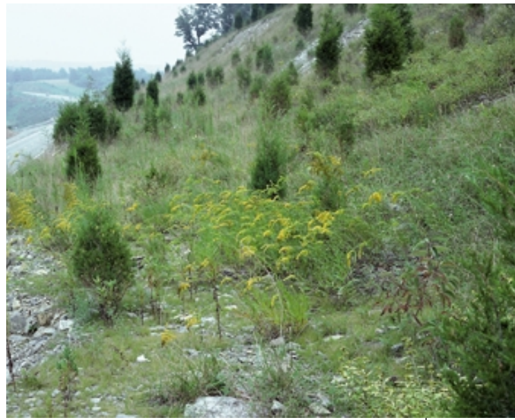
Figure 1 • Plants of Solidago shortii in population 12 (see Figure 2) on top of a ledge of the Clays Ferry Formation in the Eden Shale Region along new US 68 in Nicholas County, Kentucky.

Populations 1, 2, and 4 are in Blue Licks Battlefield State Park; population 7, small portions of populations 8 and 10, and most of population 12 are on rights-of-way of state or US highways; and portions of population 8 not on the highway right-of-way are owned by the Kentucky Chapter of The Nature Conservancy. Populations 1 and 2 are within a designated nature preserve of the Kentucky State Nature Preserves Commission. The