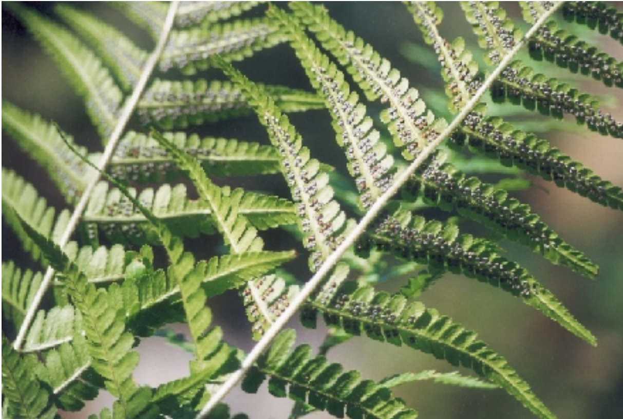
Figure 1 • Indusia and mature spores on the underside of a frond of Dryopteris filix-mas .

Glacier Ferns from page 5 which begins development as a small, pale green, algae-like chain of cells known as the germ filament. Development continues into a flat, heart-shaped structure called the prothallus (Figure 2). Slender holdfasts, known as rhizoids, develop on the lower surface of the prothallus. Both reproductive structures, the antheridium (male), and the archegonium (female), develop on the lower surface of the prothallus. Antheridia usually appear before the archegonia, mostly near the rhizoids. Archegonia appear near the notch of the prothallus. Water must be present for the multiflagellate sperm to swim from an antheridium to eggs in the archegonium. After fertilization, the young sporophyte receives its nutrients from the gametophyte through a foot-like structure. Further development is rapid, and once the sporophyte achieves a level of photosynthesis sufficient to maintain itself, the gametophyte disintegrates (Figure