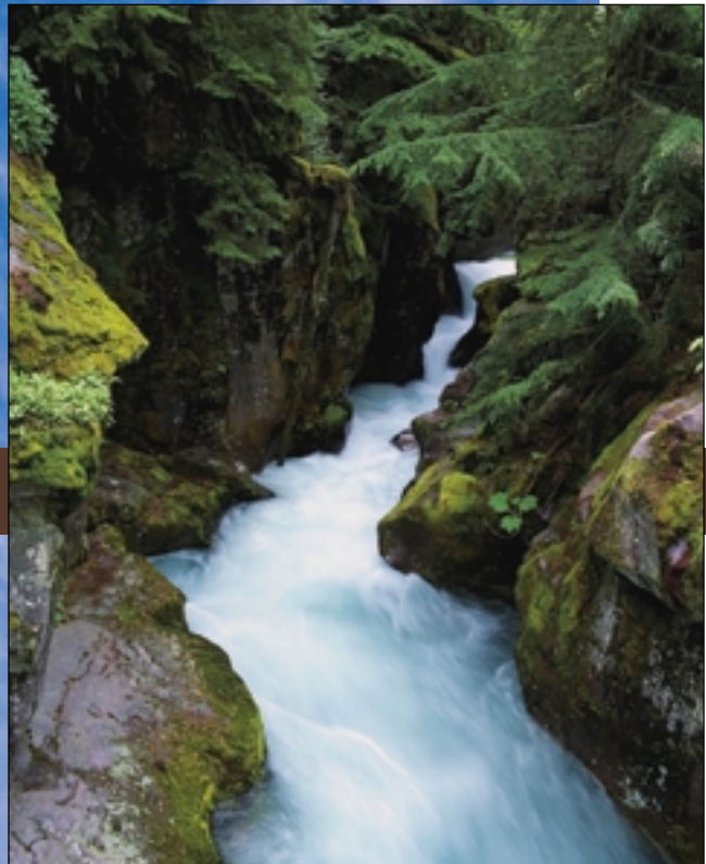
Avalanche Creek in Glacier National Park