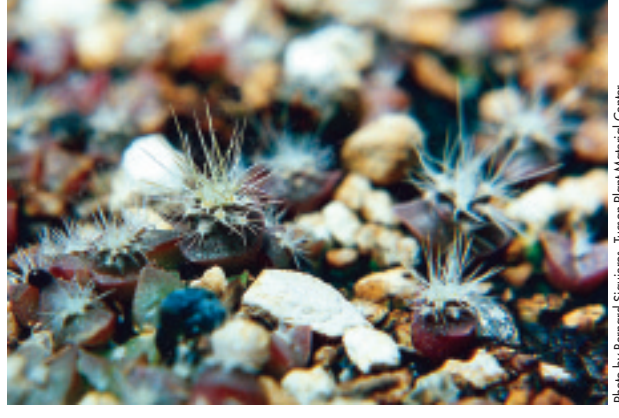
Figure 4 • Young saguaro seedlings. Note the reddish color indicating healthy plants.