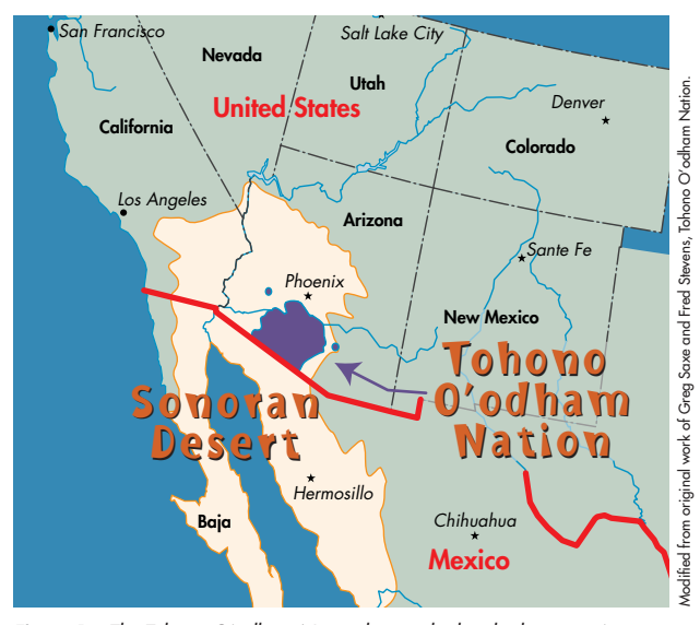
Figure 1 • The Tohono O'odham Nation lies on the border between Arizona and the Republic of Mexico within the Sonoran Desert.

A cooperative agreement involving the Tohono O'odham Soil and Water Conservation District, Natural Resources Conservation Service, and the Cyprus Tohono Corporation was initiated in 1994 to address concerns of the Tohono O'odham Nation regarding reclamation and revegetation efforts on the Cyprus Tohono Mine. Saguaro cactus salvage and transplant techniques were begun at the mine, but the technique is expen-