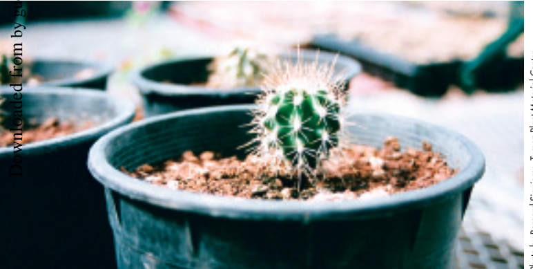
Figure 5 • A 6-mo-old saguaro seedling recently transplanted into a larger pot.

The saguaro cactus is highly regarded for its cultural contributions by the Tohono O'odham, reflected in many of the stories that are passed from generation to generation